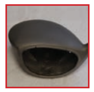
Golf Club Head

The ISM process has some inherent advantages over the Vacuum Arc Skull Casting (VASC) process that has traditionally been used in many titanium and reactive metal casting applications.