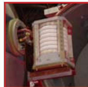
Rapid Exchange Melt Coil

The thermal baffle in a DS / SC system is normally positioned in place during the heater set up, with the furnace open and heater cold. Consarc has developed reliable automatic baffle clamping systems that allow the baffle to be exchanged automatically without cooling down the heater or opening the melt chamber. The baffle auto-clamping system utilizes a series of externally mounted actuators and internal clamps to secure and release the baffle underneath the heater. The baffle can be introduced and removed through the mold chamber vacuum lock in a matter of minutes thereby saving considerable production time.