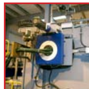
Tilt Translation System